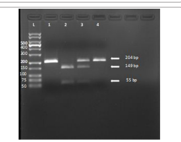
Figure 2. The PCR-RFLP analysis of CYP1A1 m2 polymorphism. The DNA from healthy individuals was subjected to PCR followed by RFLP using BsrD1 digest. The reactions were resolved on ethidium bromide-stained 2.5% agarose gel electrophoresis. Lane L shows 50bp Molecular Weight(MW) DNA Ladder, lane 1 represent PCR product, lane 2 represent homozygous wild-type allele(wt/wt), lane 3 represent heterozygous allele(wt/mt), lane 4 represent homozygous mutant-type allele(mt/mt).

Figure 1. The PCR-RFLP analysis of CYP1A1 m1 polymorphism. The DNA from healthy individuals was subjected to PCR followed by RFLP using Msp1 digest. The reactions were resolved on ethidium bromide-stained 2.5% agarose gel electrophoresis. Lane L shows 50bp Molecular Weight(MW) DNA Ladder, lane 1 represent PCR product, lane 2 represent homozygous wild-type allele(wt/wt), lane 3 represent heterozygous allele(wt/mt), lane 4 represent homozygous mutant-type allele(mt/mt).