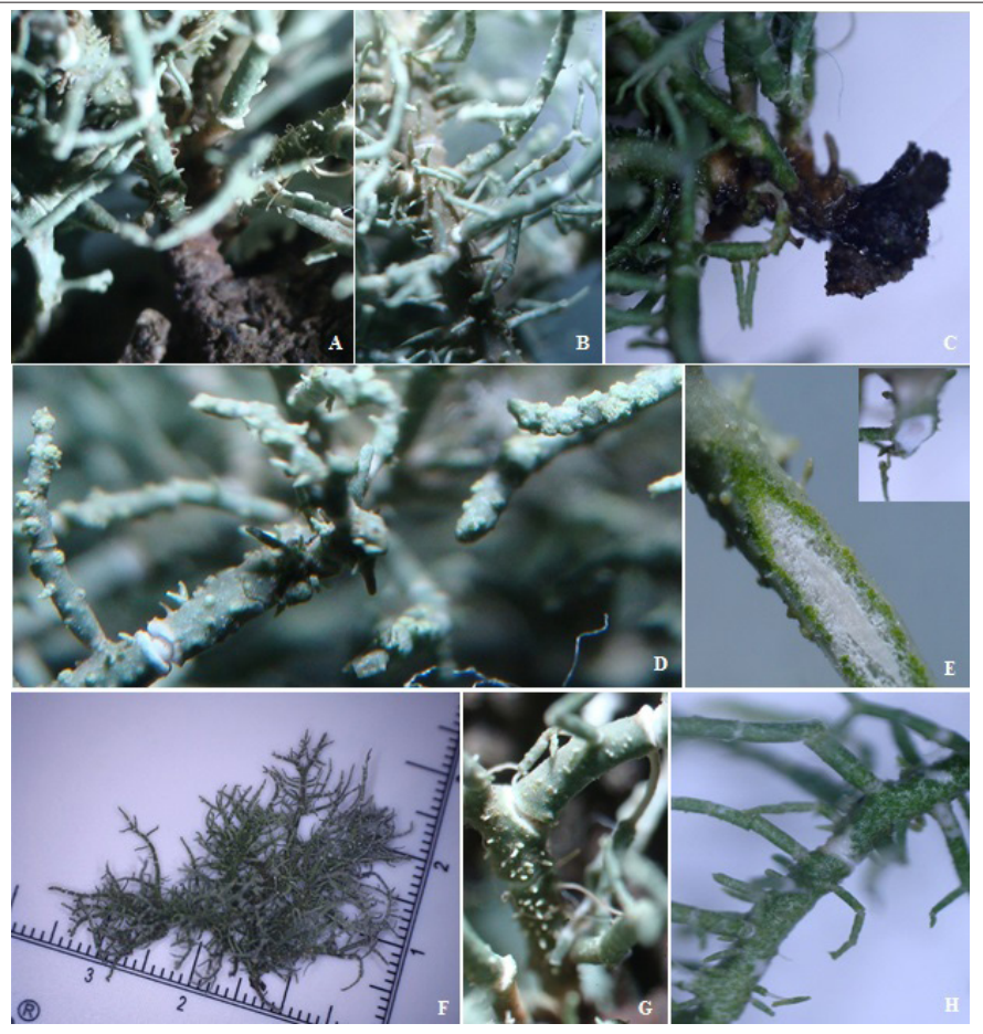
Figure 3. Usnea cornuta Körber.A: Base without cracks, B: Fibrils, C: Base of thallus, D: Lateral branches with soralia, E: Branch with medulla, F: Thallus, G: Papillae; H: Lateral branch with fibrils.

small (less than half the branch diameter), but sometimes coalescing into larger patches ( figure 3D ) near the apices of branches and fibrils as described by Van Haluwyn et al. , 2013 (10).