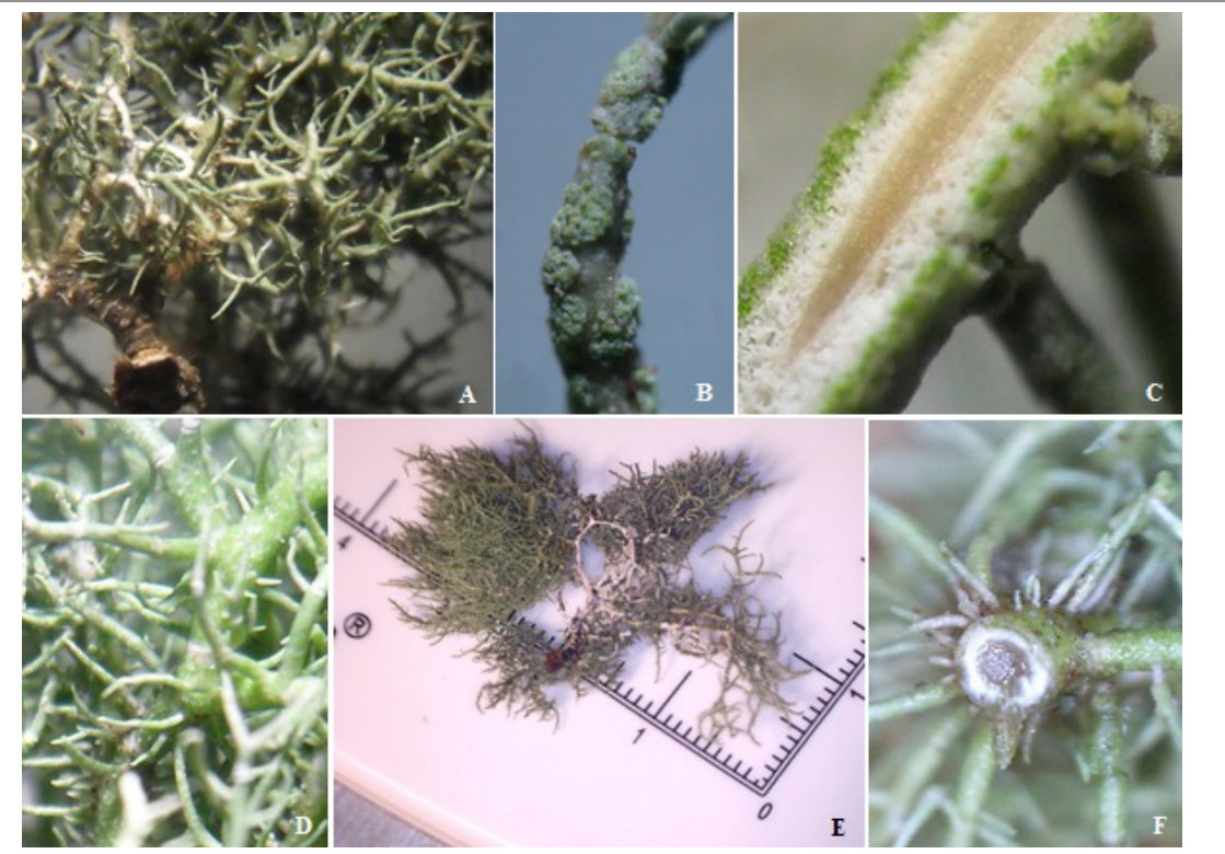
Figure 3. Usnea glabrescens (Vainio) Vainio sens. Lat. A: Attachment point and base of thallus; B: Apical branch with soralia; C: Branch with medulla; D: Soralia and papillae on main branch; E: Thallus; F: Transverse section.