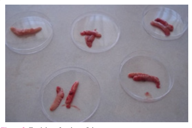
Figure 2. Testicles of male catfish.

rici ) (0.06 mg/mL). The final concentration of motil spermatozoa per straw was approximately 2x10^8 , which was counted with Neubauer Hemocytometer (9).