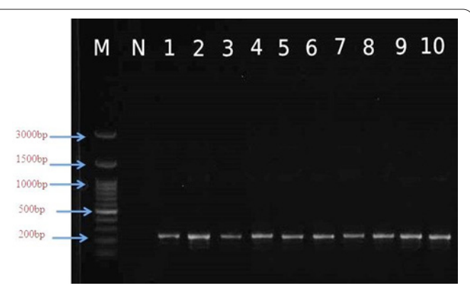
Figure 4. PCR amplified generate deep V4 (229bp) 16S rRNA of the isolates in 1% agarose gel. Lane M 100bp DNA ladder (GeneDirex). Lane N negative control that has been run without any DNA template, respectively. The bands are showing 1476bp of PCR amplicons. Lanes 1 to 10 contain PCR products from Staphylococcus aureus, Staphylococcus haemolyticus, Lactobacillus equicursoris, Streptococcus agalactiae, Enterococcus faecalis, Gardnerella vaginalis, Klebsiella pneumonia, E. coli, Proteus mirabilis and Pseudomonas aeruginosa respectively.

Figure 3. PCR amplified generate deep V8 (204bp) 16S rRNA of the isolates in 1% agarose gel. Lane M 100bp DNA ladder (GeneDirex). Lane N negative control that has been run without any DNA template, respectively. The bands are showing 1476bp of PCR amplicons. Lanes 1 to 10 contain PCR products from Klebsiella pneumonia, E. coli, Proteus mirabilis and Pseudomonas aeruginosa respectively.