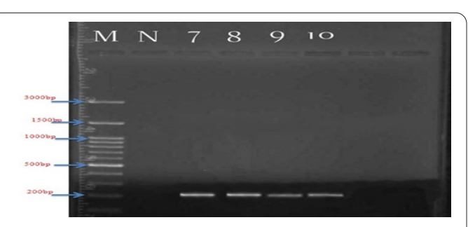
Figure 3. PCR amplified generate deep V8 (204bp) 16S rRNA of the isolates in 1% agarose gel. Lane M 100bp DNA ladder (GeneDirex). Lane N negative control that has been run without any DNA template, respectively. The bands are showing 1476bp of PCR amplicons. Lanes 1 to 10 contain PCR products from Klebsiella pneumonia, E. coli, Proteus mirabilis and Pseudomonas aeruginosa respectively.