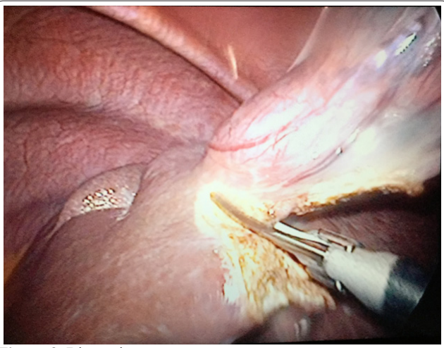
Figure 3. Biopsy image.