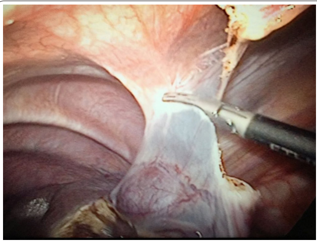
Figure 1. Image of the hepatic lesion was implanted in the falciform ligament with hepatic subcapsular invasion and could be completely resected and there were other smaller implants on the surface of the diaphragm.

Recommendations in the literature for the follow-up of an ectopic spleen are varied (1,2). The significant risk of post-splenectomy sepsis put a conservative approach as a choice in asymptomatic patients. In the absence of infarction, thrombosis or hypersplenism, in patients with acute abdomen, distortion with fixation of the spleen to splenectomy is considered the best treatment (1). Splenectomy should only be recommended when there is no evidence of blood flow to the spleen after