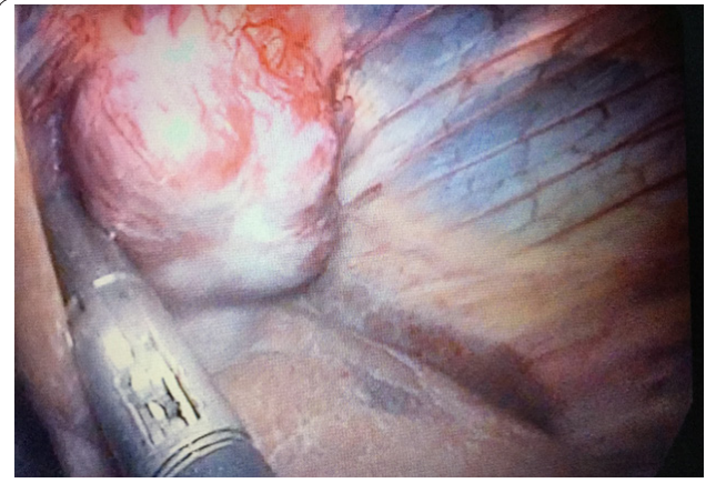
Figure 2. Ectopic spleen image.