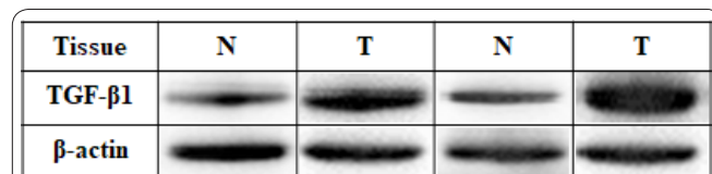
Figure 2. Western blot analysis of TGF-β1. Tumor (T) and matched adjacent healthy (N) tissue expression of TGF-β1 was evaluated at protein level by Western blot, as described under Materials and Methods.

symptoms in the early stages and is frequently diagnosed at the advanced stage only. The absence of biomarkers for early detection of ccRCC is a critical problem and complicates both early diagnosis and treatment. Thus, discovering efficient biomarkers for ccRCC would significantly improve early diagnosis and therapeutic effectiveness, and would lead to a decrease of number of mRCCs at time of diagnosis.