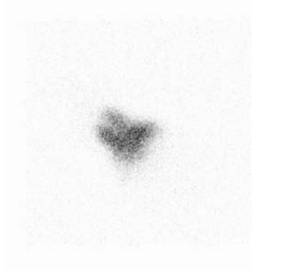
Figure 4. Image of <sup>153</sup>SmCl<sub>3</sub> injected intravenously.

Bremsstrahlung scintigrapy of <sup>90</sup>Y-HA in gamma camera were performed in Wistar rats, after 7 days of administration in the knee joint (Figure 5). No activity was found extraarticularly after this period of time.