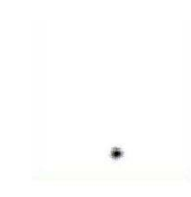
Figure 2. Biological distribution of <sup>177</sup>LuCl<sub>3</sub> injected in the knee joint.

Thus, the bones and urine should be, and in fact are, the two biologic compartments where radioactivity is found in any significant amount. Excretion of activity in the urine occurs mostly during the first 48 hours and is insignificant. Bone localization accounts for approximately 4 - 5% of the administered activity and for \approx 65\% of total leakage (2).